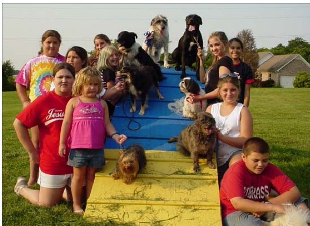
If you would like to learn more about how to properly care for your family dog, learn agility and obedience training and help out your community, then Paws 4-H Dog Club members invites you to be part of their 4-H family.