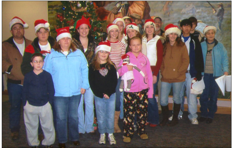
Livestock, Trailblazer and Teen 4-H Club members took to the streets in December to share some of their favorite Christmas Carols with residents at Morning View Assisted Living, Hardin Memorial Hospital Children's Floor, Woodland Terrace and Medco Nursing Home.