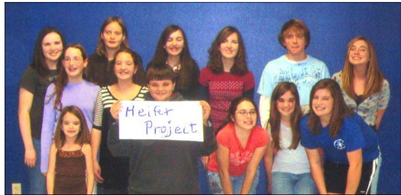
Hop to It Rabbit Club members recently purchased a trio of rabbits to send to a needy family in Russia as part of the "Heifer International" project. For more than 60 years this program has worked to end world hunger & helps impoverished families in 128 countries lift themselves out of poverty and achieve self-reliance.

4-H is a community of young people across America who are learning leadership, citizenship and life skills.