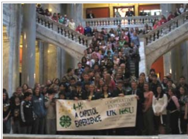
4-H Capitol Experience 2007