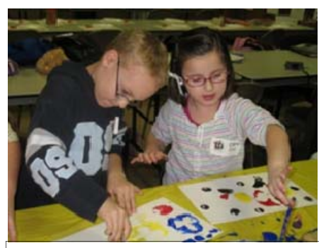
Clover Buds painted with different types of veggies.