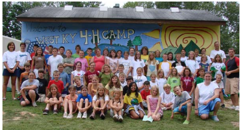
2008 Hardin County 4-H Campers at Dawson Springs 4-H Camp in Western KY.