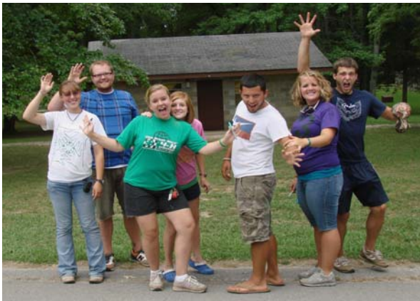
Dawson Springs 4-H Camp Staff wave goodbye as Hardin County Campers head back home!