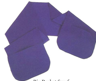
Big Pocket Scarf,

✂ Basic sewing supplies; only Big Pocket scarf requires 2/3 yrd. of fleece.